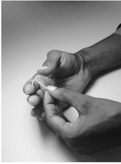
AVIBELA is small and flexible.