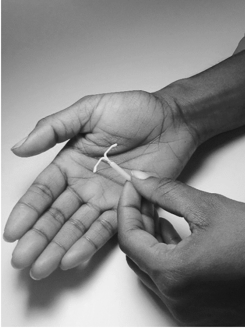
AVIBELA is small